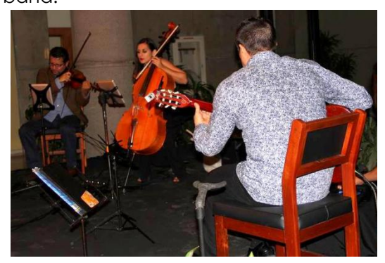
In brief, everybody got new good memories to add to the life of our young but enthusiastic UTN.

The main celebration was the opening to the UTN university week where the variety of activities was as large as the diversity of our community. There was a rodeo in Atenas, a 6 kilometer walk and run race in San Carlos and Alajuela, several folkloric dance presentations in Guanacaste, photography exhibits. plays, several workshops and conferences as well as street games in all campuses. To finish this great celebration, there was a concert with the Percance band.