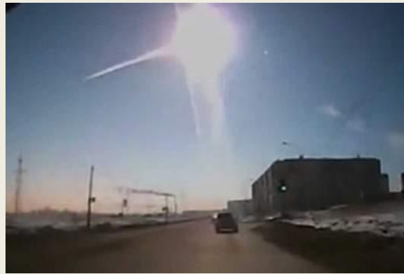
The meteor hit Chelyabinsk

(Information taken from: http://www.foxnews.com/science/2013/02/15/injuries-reported-after-meteorite-falls-in-russia-ural-mountains/ )